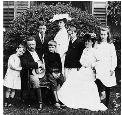
Roosevelt Family in 1903 with Quentin on the left, TR, Ted, Jr., "Archie", Alice, Kermit, Edith, and Ethel

Roosevelt's lasting pop culture legacy is the stuffed toy bears — teddy bears — named after him following an incident on a hunting trip in Mississippi in 1902. Roosevelt famously ordered the mercy killing of a wounded black bear. After a national cartoonist illustrated the President with a bear, a toy maker heard the story and asked Roosevelt if he could use his name on a toy bear. Roosevelt approved, and the teddy bear was born. Bears and later bear cubs became closely associated with Roosevelt in political cartoons thereafter.