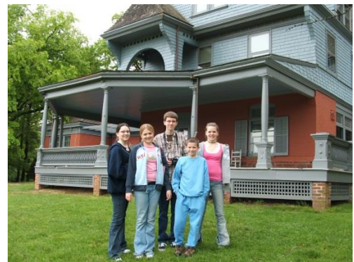
Sagamore Hill, Roosevelt's estate