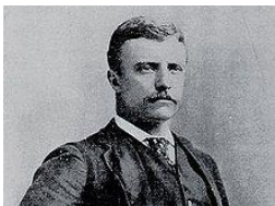
Roosevelt as NYPD Commissioner 1895

Roosevelt became president of the board of New York City Police Commissioners in 1895. During his two years in this post, Roosevelt radically reformed the police department. The police force was reputed as one of the most corrupt in America. The NYPD's history division records that Roosevelt was "an iron-willed leader of unimpeachable honesty, who brought a reforming zeal to the New York City Police Commission." Roosevelt established new disciplinary rules, created a bicycle squad to police New York's traffic problems, and standardized the use of pistols by officers. Roosevelt made a habit of walking officers' beats late at night and early in the morning to make sure they were on duty.