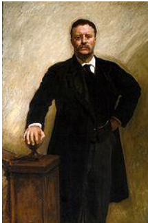
Official White House portrait by John Singer Sargent

In the 1904 presidential election, Roosevelt won the presidency in his own right in a landslide victory.