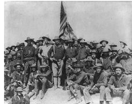
Colonel Roosevelt and the Rough Riders after capturing San Juan Hill

Upon the 1898 Declaration of War launching the Spanish-American War, Roosevelt resigned from the Navy Department. With the aid of U.S. Army Colonel Leonard Wood, Roosevelt found volunteers from cowboys from the Western territories to Ivy League friends from New York, forming the First U.S. Volunteer Cavalry Regiment. The newspapers called them the " Rough Riders. " Roosevelt was promoted to Colonel and given command of the Regiment.