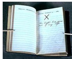
Diary Entry Feb 14, 1884

Alice Hathaway Lee was the first wife of Theodore Roosevelt and mother of their child, Alice. Roosevelt's wife, Alice died of kidney failure two days after Alice Lee was born. Theodore Roosevelt's mother had died of typhoid fever in the same house, on the same day, at 3 am, some eleven hours earlier. After the near simultaneous deaths of his mother and wife, Roosevelt left his daughter in the care of his sister, Anna "Bamie/Bye" in New York City. In his diary he wrote a large X on the page and wrote "the light has gone out of my life."