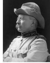
Colonel Theodore Roosevelt

the Spanish-American War and was an enthusiastic proponent of testing the U.S. military in battle, at one point stating "I should welcome almost any war, for I think this country needs one".