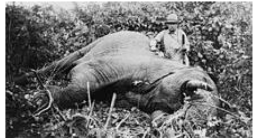
Roosevelt standing next to a dead elephant during a safari

Roosevelt declined to run for re-election in 1908 and retired to Oyster Bay, New York. He went on a safari to Africa where he collected specimens for the Smithsonian Institute. The safari was partially financed by Andrew Carnegie.