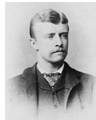
Roosevelt as NY State Assemblyman, 1883 photo

He graduated Phi Beta Kappa (22nd of 177) from Harvard in 1880, and entered Columbia Law School. When offered a chance to run for New York Assemblyman in 1881, he dropped out of law school to pursue his new goal of entering public life. He was elected to the Assembly of New York State, holding office for three years and distinguishing himself as an ardent reformer.