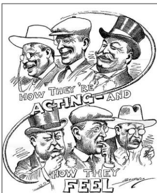
Presidential Candidates in the 1912 Election – Above: Wilson (Democrat Party), Taft (Republican Party), and Roosevelt (Progressive/Bull Moose Party)

Now, friends, of course, I do not know, as I say, anything about him; but it is a very natural thing that weak and vicious minds should be inflamed to acts of violence by the kind of awful mendacity and abuse that have been heaped upon me for the last three months by the papers in the interest of not only Mr. Debs but of Mr. Wilson and Mr. Taft.