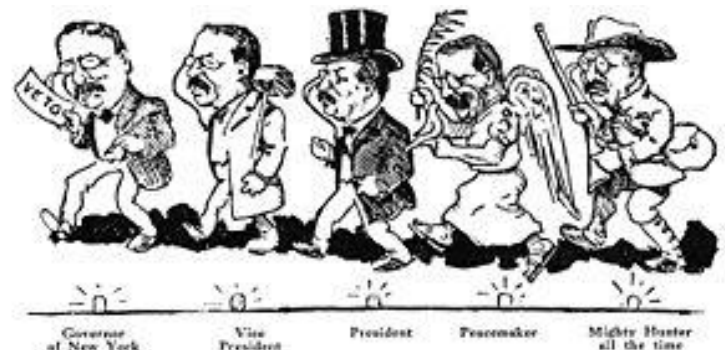
1910 cartoon shows Roosevelt's multiple roles from 1899 to 1910