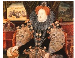
Elizabeth I Armada Portrait