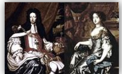
William and Mary