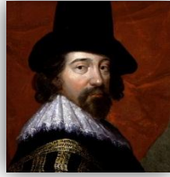
Sir Francis Bacon