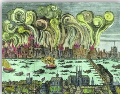
The Great Fire of 1666